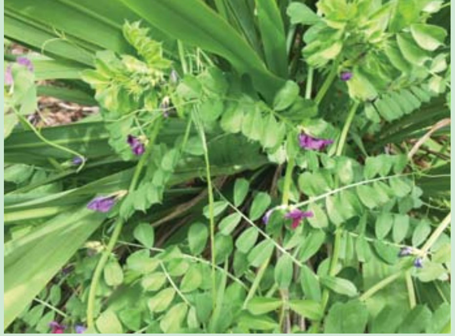
Purple vetch is a nitrogen-rich cover crop.